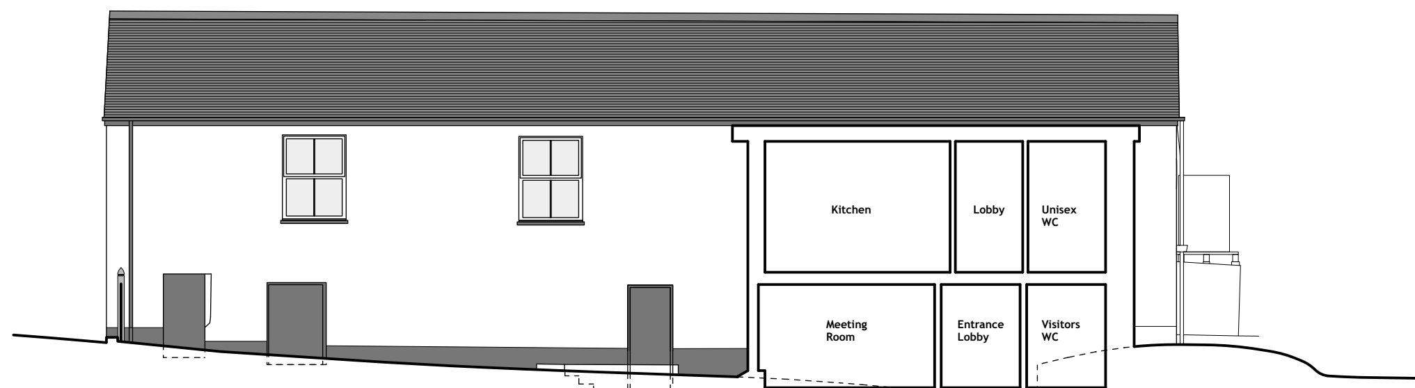
South East Elevation/Section 7,000m

Rev A: Drawing amended to show reduced proposal with green oak frame and natural stonework - 23 Nov 2021