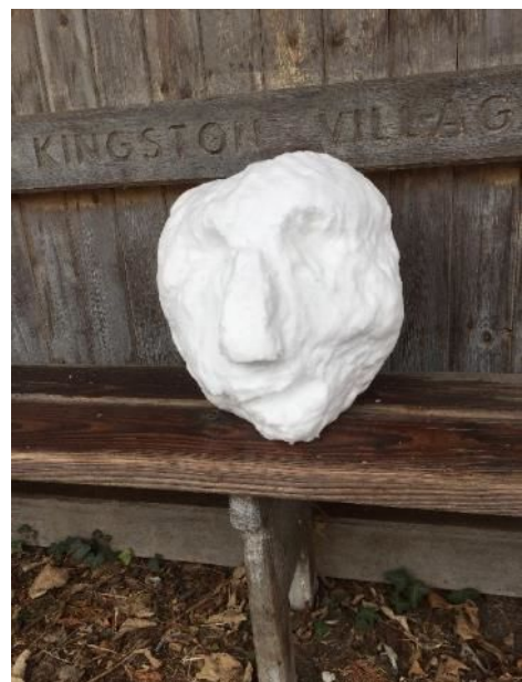
Snow sculpture in bus shelter 18.03.2018 by unknown sculptor.

Action Fraud (Action Fraud, Administrator, National)