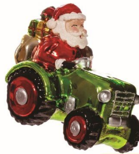
Santa on his way at 10-ish