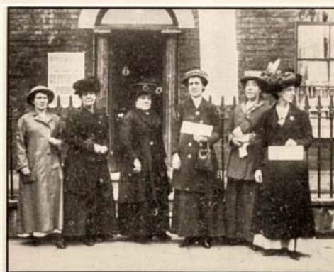
THE DEPUTATION TO THE PRIME MINISTER.